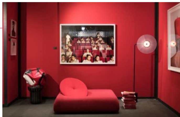
Appartement du Collectionneur 2017 ©Daisuke Takakura